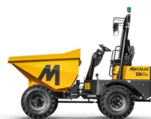
TA3H / TA3SH